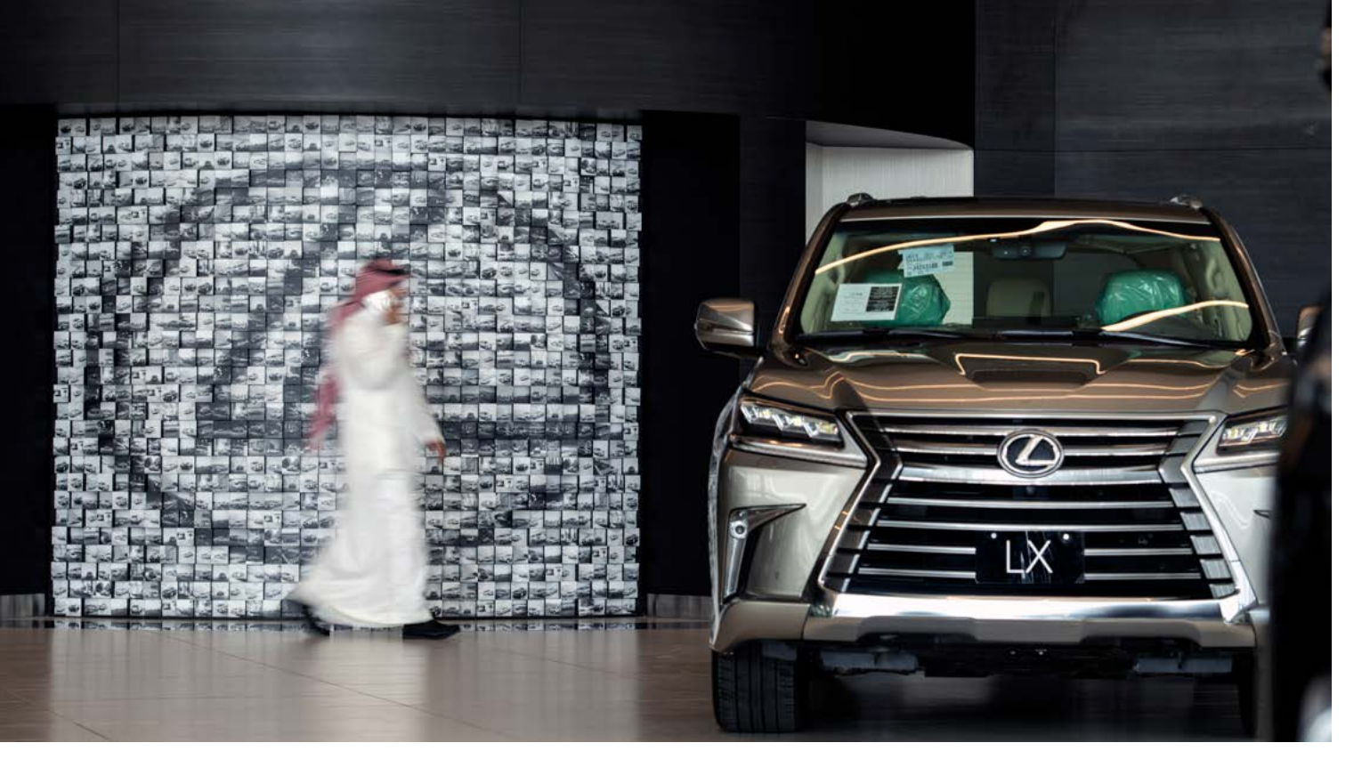
ALJ Motors operates a network of distributorships and dealerships, including this Lexus center in Riyadh.

so it will certainly vary from country to country. In the Gulf, the automotive sector has been slower to adapt to change compared with other industries, but there are some exciting advances taking place. For example, electric-vehicle charging stations have made their way into Saudi Arabia. And recently Saudi Arabia announced that NEOM, "the land of the future," will have fully autonomous mobility by 2030, with only electric vehicles and public transport. So, we have a lot to look forward to in the next decade.